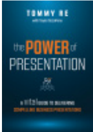
Based on the book by Tommy Re

The program is designed to allow participants to work on their own material, making the session extremely relevant and practical. If participants don't have material of their own, they can choose from several real-world business presentation prompts.